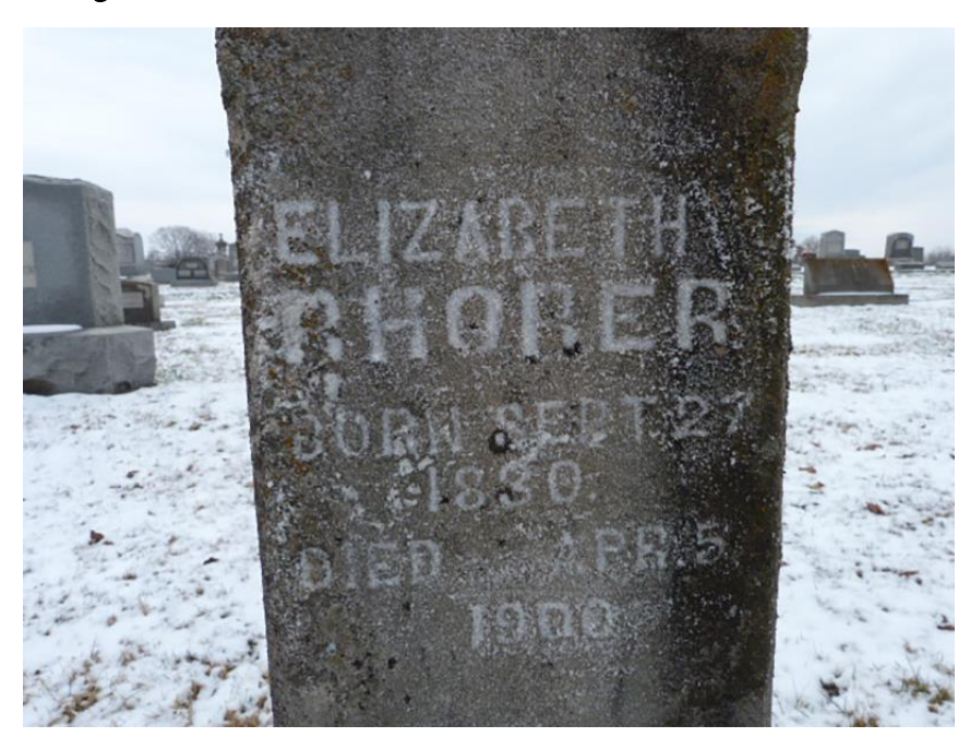
Copyright © 2019 Cemetery Conservators for United Standards – All rights reserved