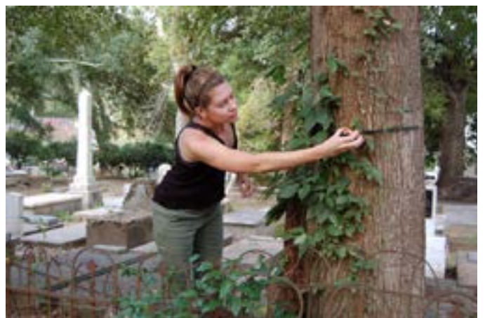
Figure 12. A cemetery professional undertakes a tree inventory in American Cemetery, Natchitoches, LA, to determine the health of trees in the cemetery. Management decisions for trimming or removal are based on the inventory.

Inappropriate maintenance activities can be devastating. One of the most common threats stems from improper lawn care, particularly the misuse of mowing equipment and string trimmers (weed whackers). The use of large mowers or mishandling them can lead to displacement of markers. Scrapes, gouges and even breakage also can occur. Improper use of string trimmers in areas immediately adjacent to grave markers can result in