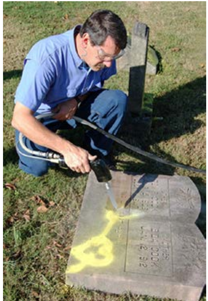
Figure 18. Graffiti is carefully removed using a low-pressure dry-ice misting instrument.

If the graffiti is water soluble, it can be removed using water and a soft cloth or towel. Rinsing the cloth frequently helps to avoid smearing graffiti on unaffected areas. If the graffiti is not water soluble, organic solvents or commercial graffiti removal products suitable for the grave marker material are recommended. Products should be tested prior to use. General cleaning of the entire marker is a good follow-up for a more even appearance. For deep-seated graffiti, poultice cleaning (previously described) may be required to extract staining materials.