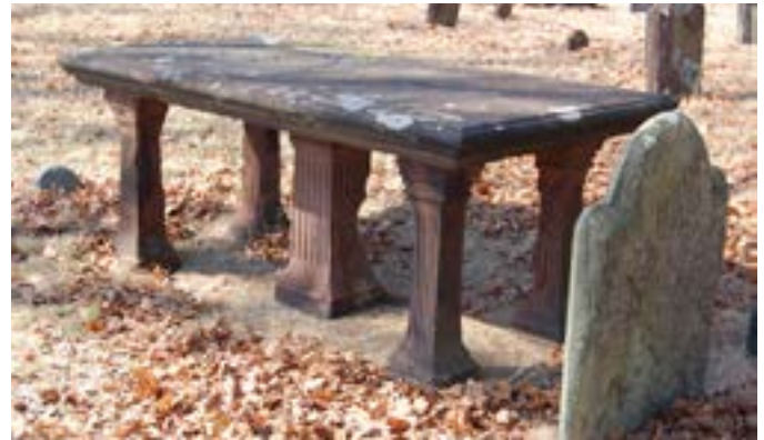
Figure 4. This sandstone table tomb, located in Cedar Grove Cemetery, New London, CT, is an engineered grave marker structure consisting of a horizontal stone tablet supported by four vertical table “legs” with and a central column,.

Grave markers can also be engineered structures. Examples of grave marker structures include masonry arches, box tombs, table tombs, grave shelters, and mausoleums (Fig. 4). The box tomb is a rectangular structure built over the gravesite. The human remains are not located in the box itself as some believe, but