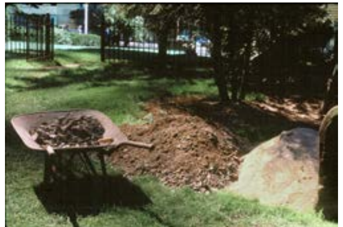
Figure 20b. To facilitate drainage, crushed stone, gravel, and sharp sand line the hole and are hand-tamped around the stone after placement.