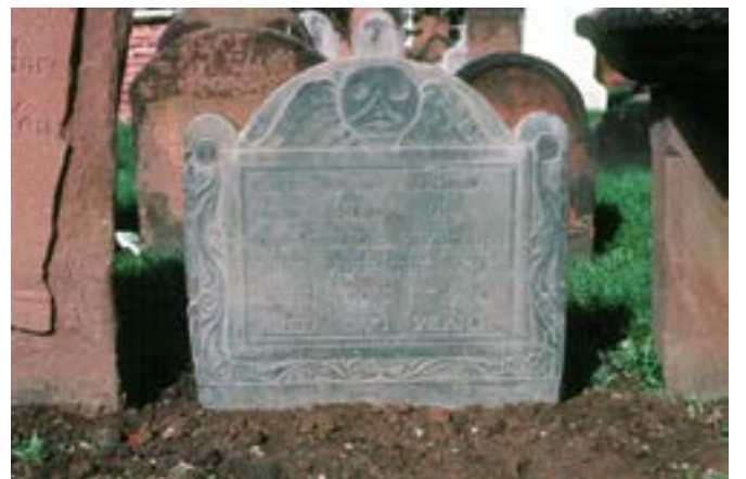
Figure 20c. The reset ground-supported grave marker should be level and plumb.