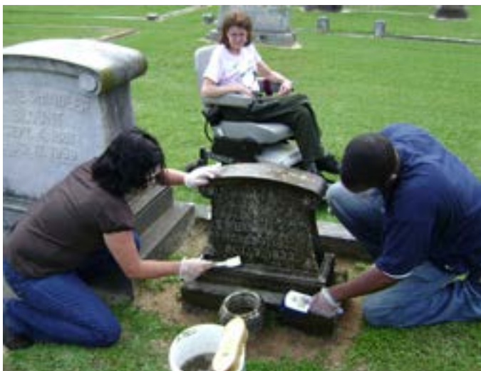
Figure 17. Volunteers can undertake cleaning of grave markers once they have received initial training. Cleaning methods may include wetting the stone, using a mild chemical cleaner, gently agitating the surface with a soft bristle brush, and thoroughly rinsing the marker with clean water.

General maintenance may involve low-pressure water washing. In most cases, surface soiling can be removed with a garden hose using municipal water or domestic