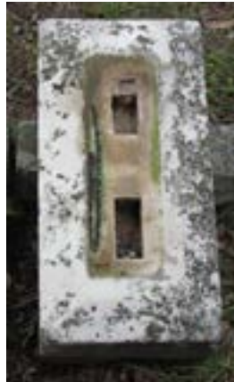
Figure 3. A multi-element grave marker from the early 19th century in the St. Michael’s Cemetery, Pensacola, FL, consists of a vertical element with tabs (left image) into a slotted base (right image).

Stacked-base grave markers use multiple bases to increase the height of the monument and provide a stable foundation for upper elements. Tall, four-sided tapered monuments, known as obelisks, are typically placed on stacked bases. Columns or upright pillars have three main parts – a base, shaft, and capital. Multiple-element grave markers may also include figurative or sculptural components. Traditionally, stacked base grave markers were set on lead shims with mortar joints or with lead ribbon along the outer edges.