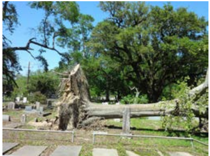
Figure 11. Woody vegetation can damage grave markers and pose a risk to visitors unless well managed and maintained.

Aside from vandalism and purposeful neglect, most risk factors attributable to human activity are unintentional. Sometimes damage to grave markers is the result of cleaning or repair done with the best of intentions. These unfortunate mistakes can be the result of insufficient training and funding, misuse of tools and equipment, and poor planning. With proper training and supervision, human risk factors can be lessened.